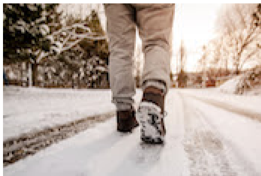
Winter Foot Care